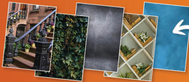
Standard Blue Background

Backgrounds, Direct Shipping, Personalization, & More Online!