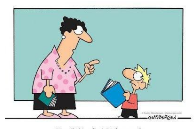
"It's called 'reading'. It's how people install new software into their brains"