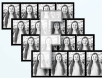
(16) Half Wallets