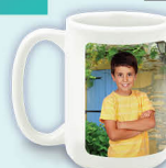
(1) Coffee Mug