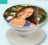
(1) Phone Socket

Questions? Ask our live chat at legacystudios.com