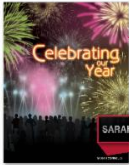
Your student's name imprinted in foil