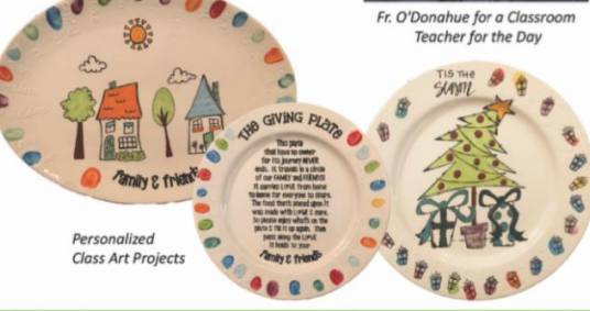
Holy Spirit Catholic School | Inspiring Minds & Igniting Hearts