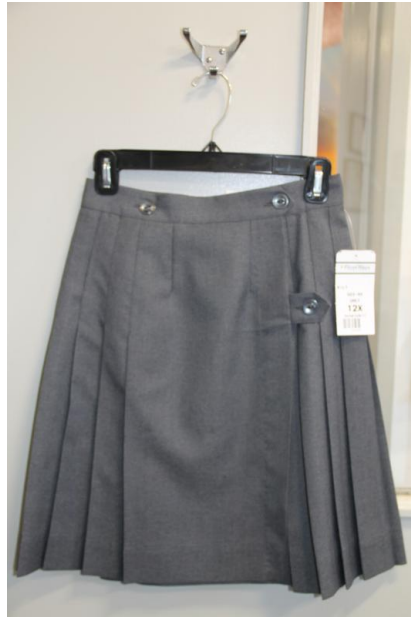
Grades 6-8 girls - year round - grey wrap-around kilt Maroon polo w/ logo

All students PreK-8, as applicable, will be in the maroon polo w/ logo