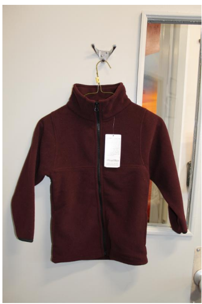
Prek-8 - optional - full zip fleece w/ logo