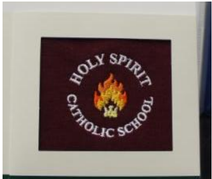
New logo for polo, jersey dress, and fleece