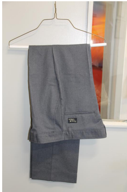
Grades 6-8 boys - year round - dark grey pants Maroon polo w/ logo