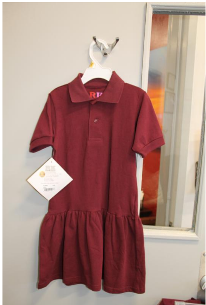
PreK & Kindergarten girls Fall & Spring - Maroon jersey dress w/ logo (traditional plaid jumper and/or pants with polo for Winter)

There will be a one year "grandfathering" of the current uniform as this is particularly important for rising 5th and rising 8th graders.