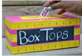
Create a Box Tops collection container.

It's a new year....and time for a new contest to support our Box Tops for Education program!