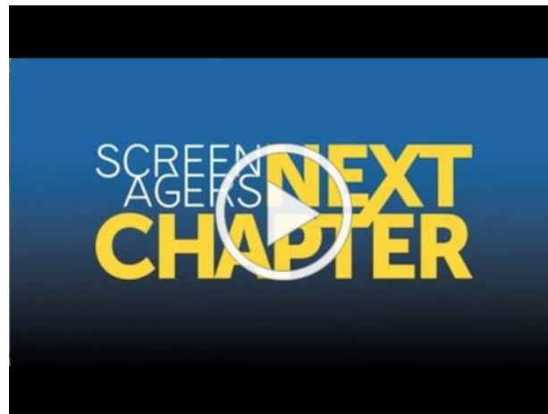
Screenagers NEXT CHAPTER (official trailer)

https://www.facebook.com/ScreenagersMovie/