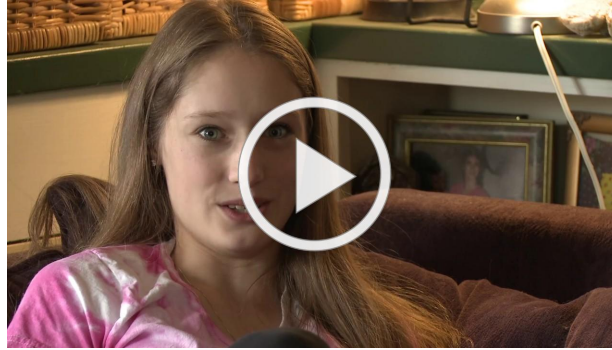
SCREENAGERS (Official Trailer)

Probably the most difficult discussion in the film is with regard to a young woman sending a private photo of herself to a boy and what resulted when he decided to make that picture public. There is nothing graphic shown but the young woman does discuss how she felt when she went to school and the cruel reactions she received from many. It is a small part of the film - maybe five minutes.