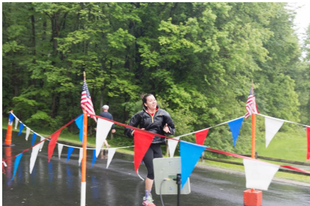
5K Spirit Run

Please note these pictures are not being taken by Lifetouch and therefore are not for purchase but are being done so that all of our students may be represented in the yearbook.