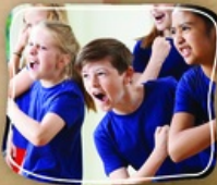
DRAMA BOOT CAMP (for Rising 1st-9th Grade)