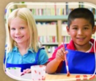
ARTS & CRAFTS FUN CAMP (for Rising 1st-3rd Grade)