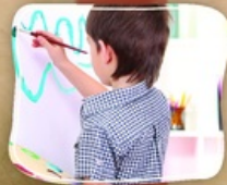
ART EXPLORER CAMP (for Rising 4th-8th Grade)

Get More Information & Register Today: www.SpotlightSummerCamps.com