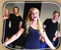
CAMP BROADWAY (for Rising 4th-12th Grade)