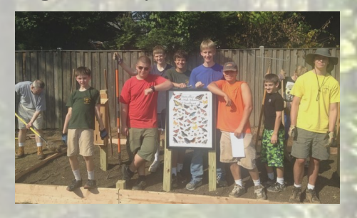
Eagle Scout Project: Computer Recycling