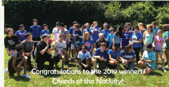
Congratulations to the 2019 winners, Church of the Nativity!

Deadline to RSVP: Monday July 19. Attendance is free. Register with your parish*