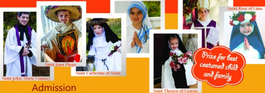
Saint John-Marie Vianney

Come dressed as your favorite saint or in your favorite costume.