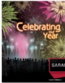
Your student's name imprinted in foil