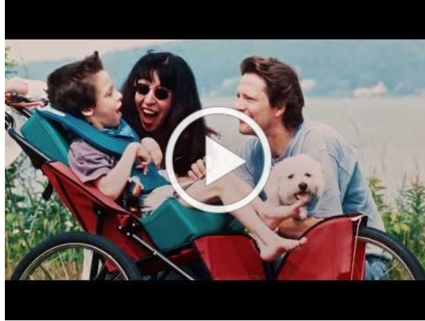
Intelligent Lives Trailer