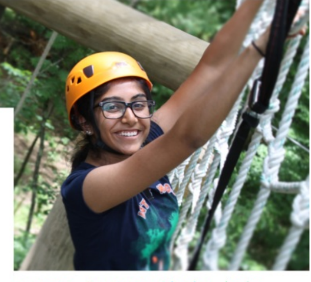
go-getter • innovator • risk-taker • leader

Email: mad_boo@hotmail.com Phone: 406-750-0612